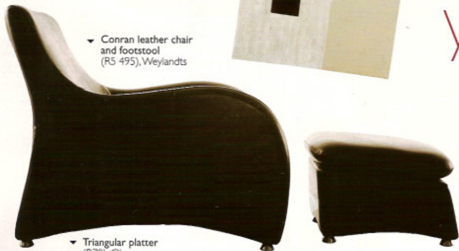
Conran leather chair and footstool (R5 495), Weylandts