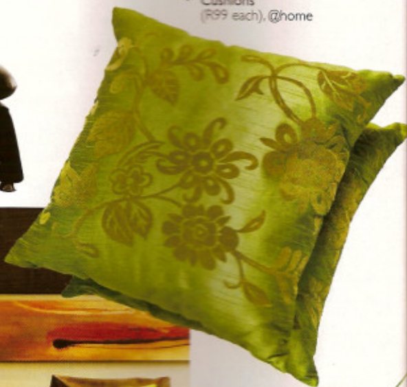
Cushions (R99 each), @home